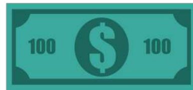
PPD Direct Cost Budget

Would your agency spend an additional 15 cents more PPD to better manage symptoms for the most challenging 10% of your patients? As easy as this question is to answer, Hospi makes it even easier, because implementation of the Macy Catheter actually saves your agency money by reducing medication costs, delivery charges, and clinician time.